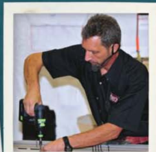
Installation Clinics Led by Top Pros