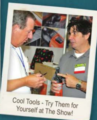
Cool Tools - Try Them for Yourself at The Show!