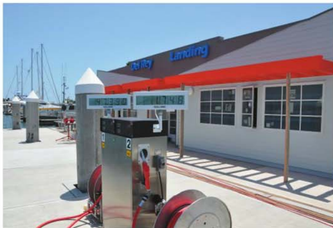
The large displays on the fuel dock at Del Rey Landing rotate to accommodate fueling from any angle.

The overall size of the floats was extraordinary. Several of the custom-designed 65-foot dock modules were more than 40,000 pounds. Most marinas need only one level of utility raceways inside the docks, but Del Rey Landing installed so many utility services that it required three raceways.