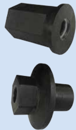
The nylon nuts come in two styles. A standard waler nut (bottom) and a weldment nut (top).